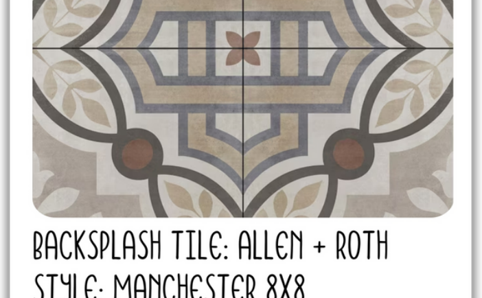
BACKSPASH TILC: ALLEN + ROTH STYLE: MANCHESTER 8X8

ALWAYS BRING YOUR SAMPLES 'INTO' YOUR SPACE... LOTS OF TIMES, ITEMS SEEM TO 'CHANGE COLOR' ONCE THEY'RE IN THEIR OWN LIGHT, NEXT TO FLOORING, ETC.