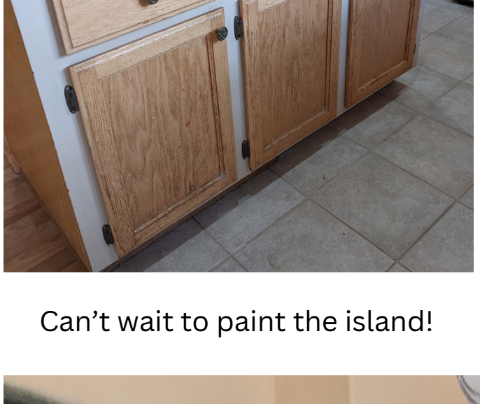
Can't wait to paint the island!