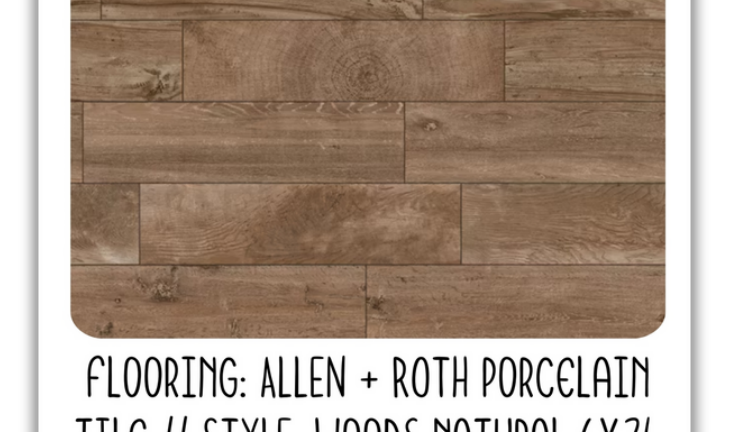
FLOORING: ALLEN + ROTH PORCELAIN TILE // STYLE: WOODS NATURAL 6X24