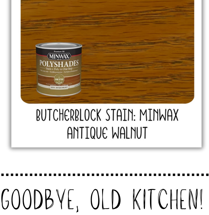
BUTCHERBLOCK STAIN: MINWAX ANTIQUE WALNUT

To keep costs down, I chose to keep the cabinetry since it was still in great shape & made of solid wood. I had it professionally sanded, primed & painted.