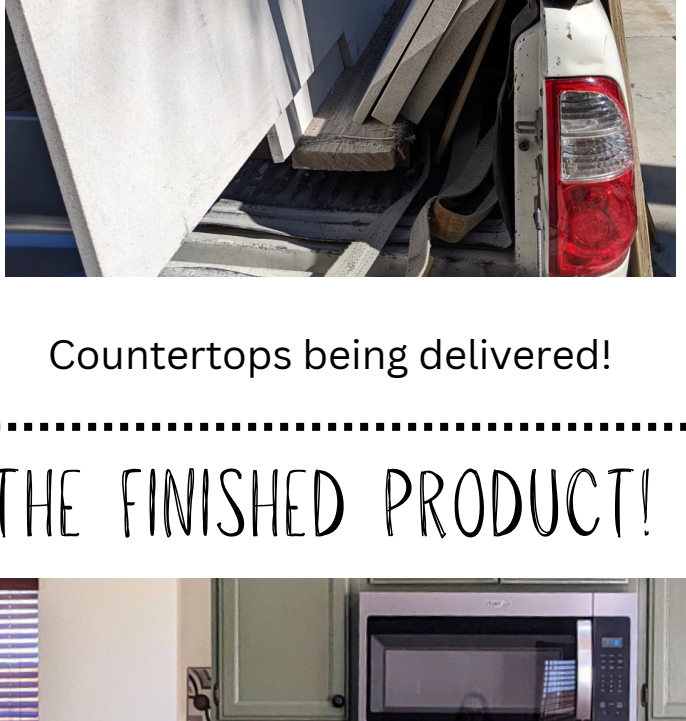
Countertops being delivered!