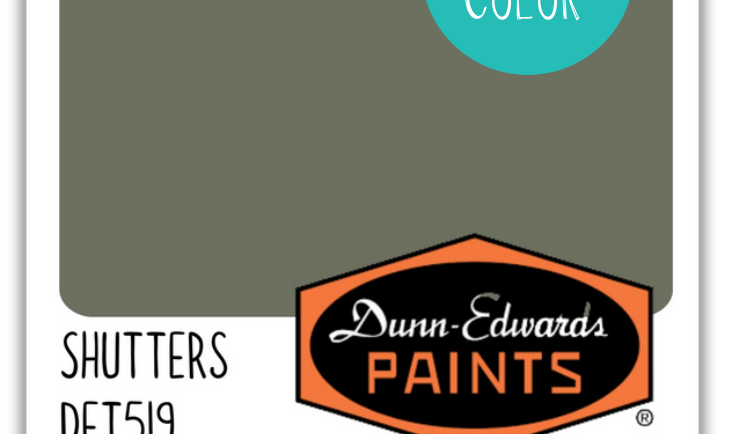
CABINET COLOR SHUTTERS DET519 Dunn-Edwards PAINTS