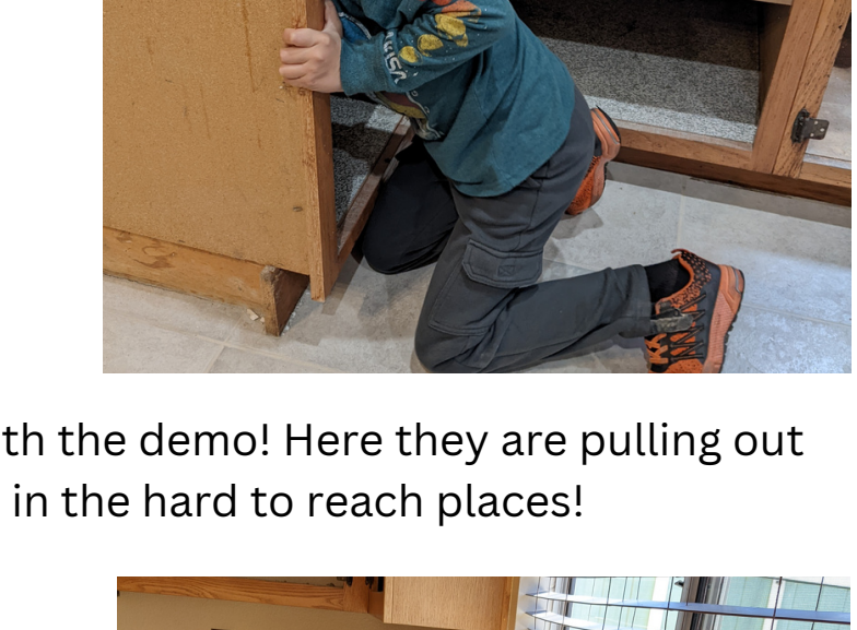
Even got my 'littles' to help me with the demo! Here they are pulling out all of the old shelf liner in the hard to reach places!