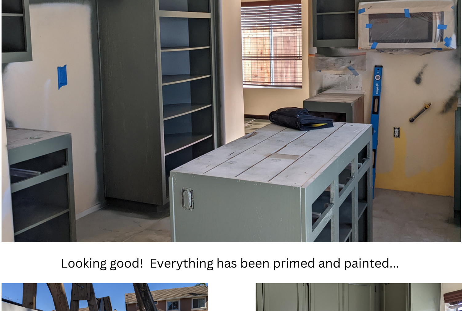
Looking good! Everything has been primed and painted...