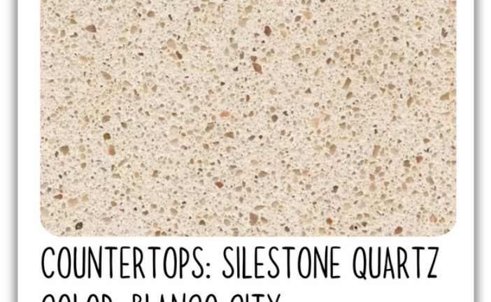
COUNTERTOPS: SILESTONE QUARTZ COLOR: BLANCO CITY