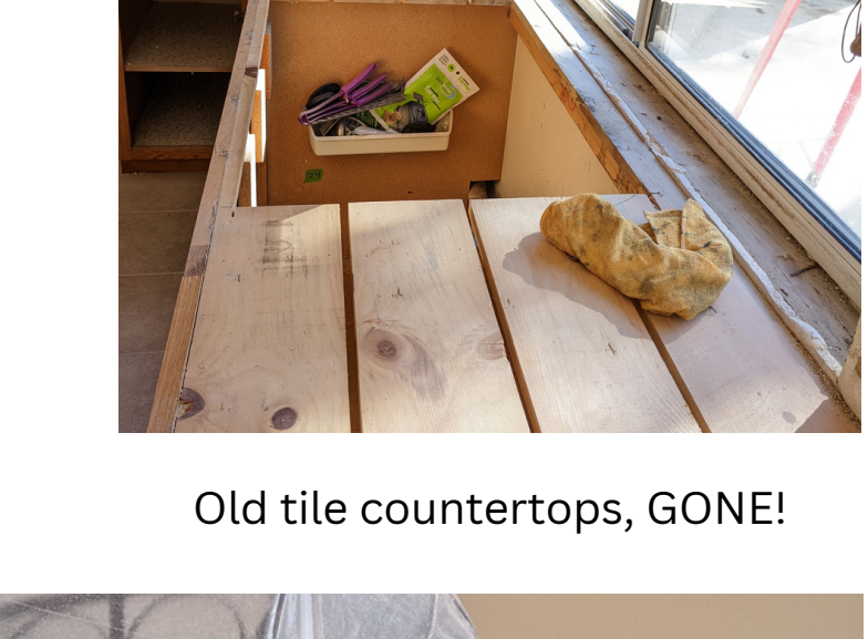
Old tile countertops, GONE!